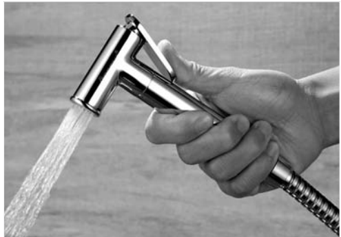
Hand held jet spray

Hold a hand jet spray with running water near the anus. Do not insert the spray inside the anus, as the pressure of the water is sufficient for it to enter the large intestine. Soon, it builds up pressure inside and most of the faecal matter, including old accumulated junk inside the colon is thrown out. The resultant freshness is unbelievable.