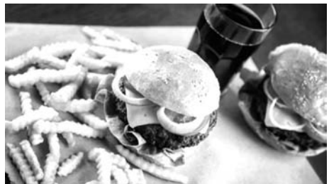
Junk food - hard on colon

The colon plays host to a zoo of bacteria, over a hundred micro-organisms live in the colon. A proper balance of healthy bacteria must be maintained inside the colon to avoid digestive ailments. Unhealthy food habits often harm this balance and cause various stomach problems. These problems can be caused by undigested food, as most food that we eat today are loaded with additives, preservatives and other chemicals, leading to a build up of toxins in the colon, which affect the body.